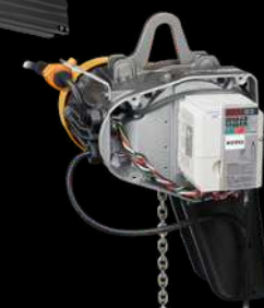
EQ WITH INVERTER